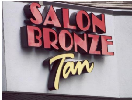
Example of Channel Lettering

CHANNEL LETTERING. A sign design technique involving the installation of three-dimensional lettering against a background, typically a sign face or building façade.